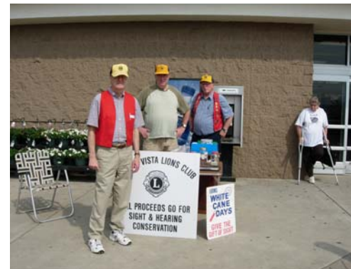
(Last Spring's picture)

That slogan raised $330 last Spring and, more importantly, helped show some of the people of our community that the Lions Club of Buena Vista is active in their mist.